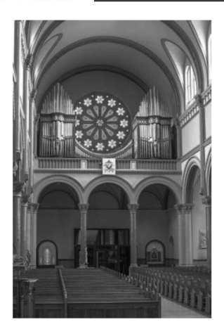
The new Buzard Organ Opus 40 for St. Vincent Archabbey, Latrobe, PA.